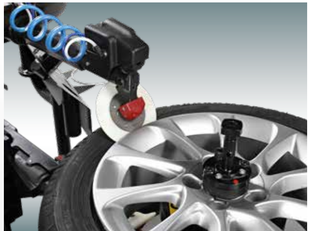
Dynamic bead breaker