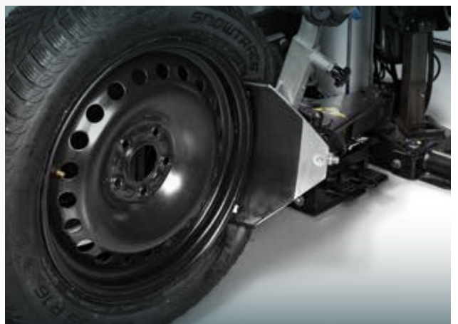
On floor bead breaker *